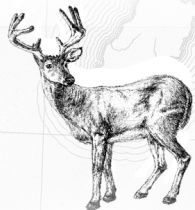
British Game Wild venison from suppliers who are passionate about farming sustainably