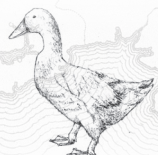
Merrifield Duck Free-range & from a farm where welfare really counts