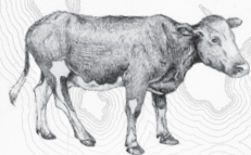
Aubrey Allen Grass-fed, dry-aged British beef