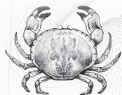
Colchester Day-boats Hand-picked & native